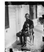
Isaac I. Stevens 25 March 1818