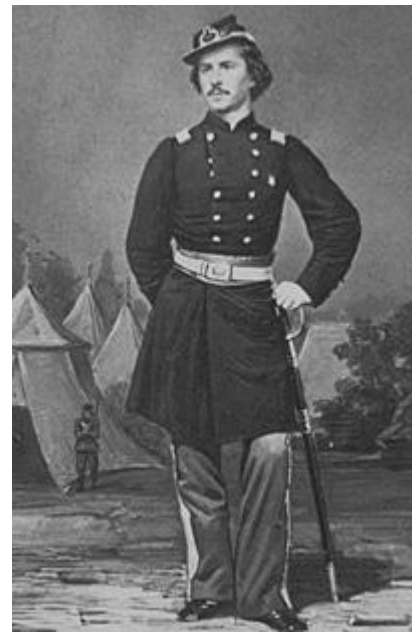
Colonel Elmer Ephraim Ellsworth 11 April 1837