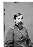
Lewis "Lew" Wallace 10 April 1827