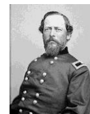
Samuel K. Zook 27 March 1821