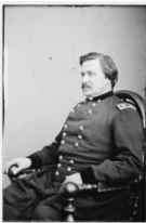
Alexander M. McCook 22 April 1822