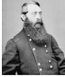
David McMurtrie Gregg 10 April 1833