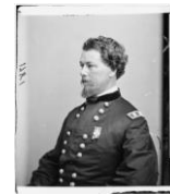
Horatio G. Wright 6 March 1820