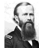
Adm. John L. Worden 12 March 1818