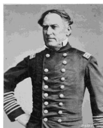
David Farragatt 5 July 1801