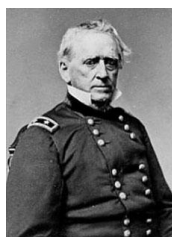
John Adams Dix 24 July 1798