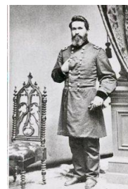
James Gilpatrick Blunt 21 July 1826

The July 2017 meeting of the Colonel E. E. Ellsworth Camp #18 SUVCW Will be held on Tuesday 18 July 2017 At the Heritage Farmstead Museum, Plano, TX.