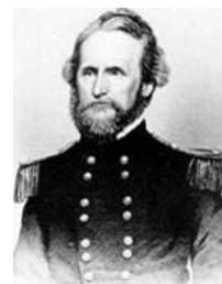
Nathanal Lyon 14 July 1818