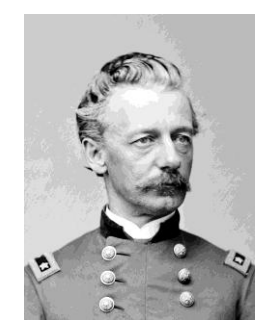
Henry Warner Slocum 24 September 1827