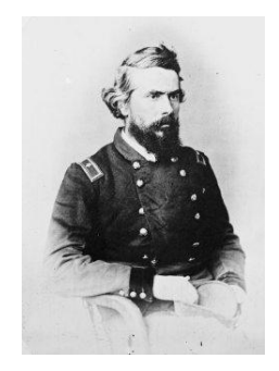
Truman Seymour 22 September 1824