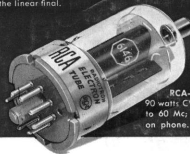
RCA-6146 90 watts CW input up to 60 Mc; 67.5 watts on phone.

Every Tube is RCA... from VFO to the 6146 Final