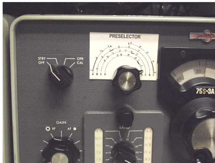
Dial installed on Collins 75S-3A receiver