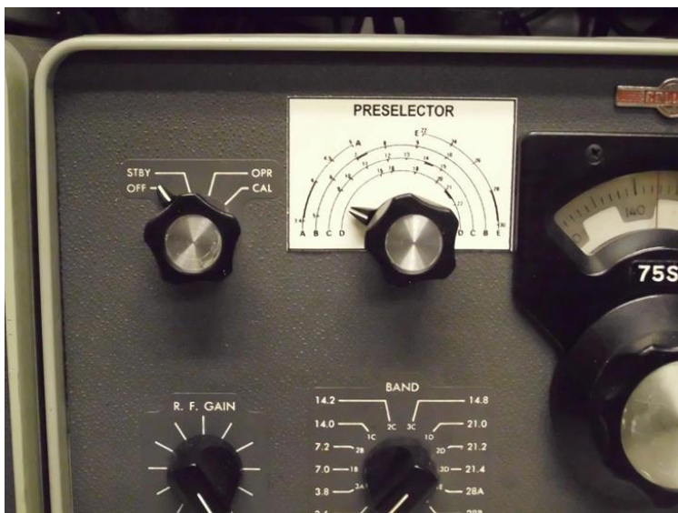
Dial installed on Collins 75S-1 receiver