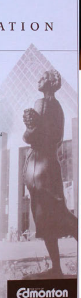
Don Iveson MAYOR OF THE CITY OF EDMONTON