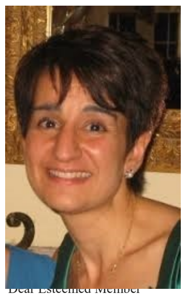
Schools and Friends of IHLA,

First and foremost, on behalf of the IHLA Board, I wish you all a restful and enjoyable summer time with friends, family, and heritage language community members!