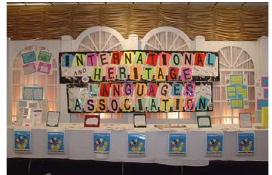
Mother Language Day Display, 2006

Read an interesting article about the best time to introduce children to a second language.