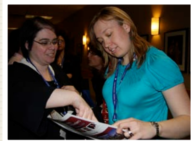
DELEGATES AT THE LWB