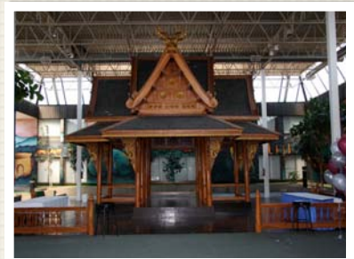
THE PAGODA AT LWB