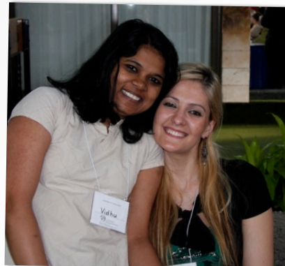
VOLUNTEERS AT LWB