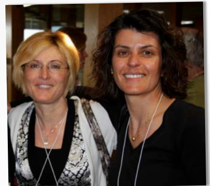
VOLUNTEERS AT LWB