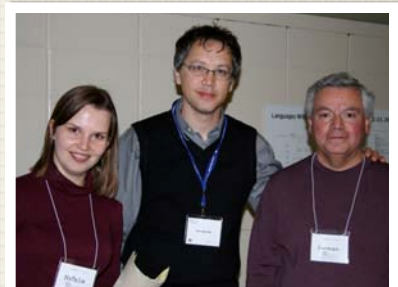
VOLUNTEERS AT LWB