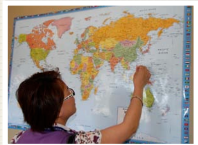
DELEGATE AT THE LWB