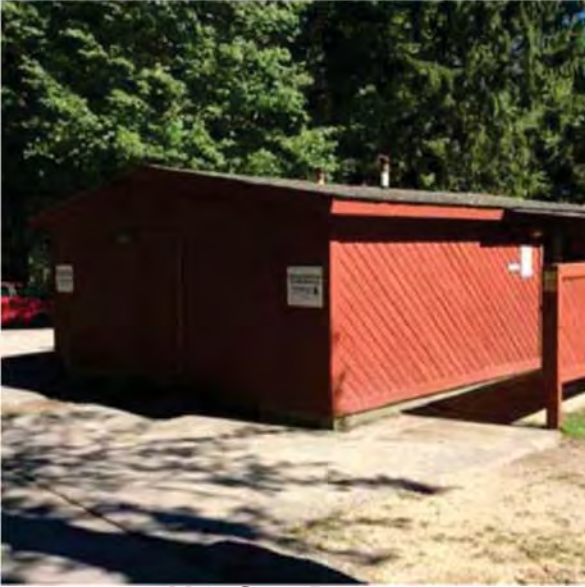
Main Camp Restroom