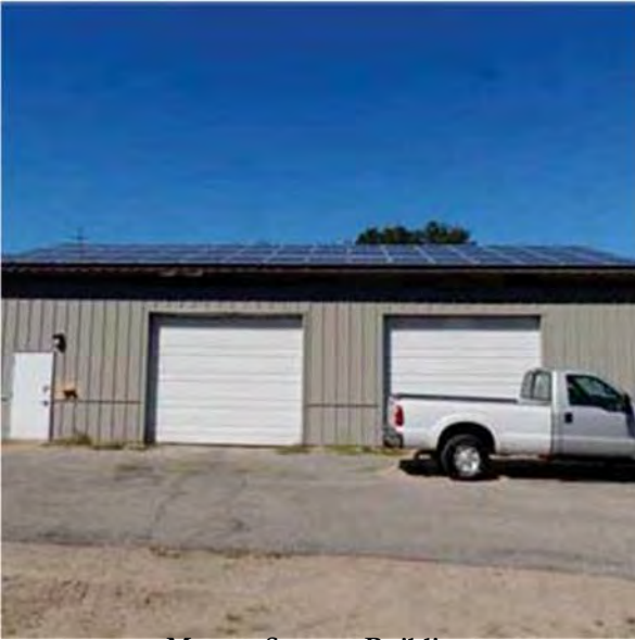
Morton Storage Building