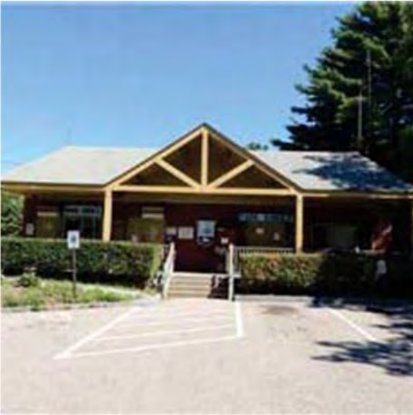
Recreational Control Station