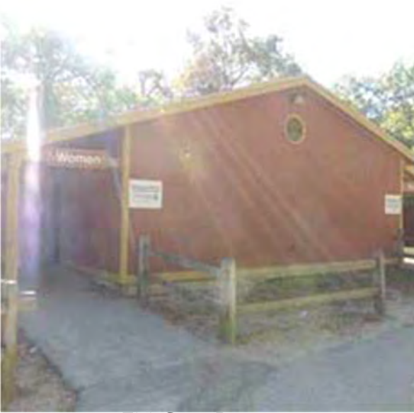
Fish Camp Restroom