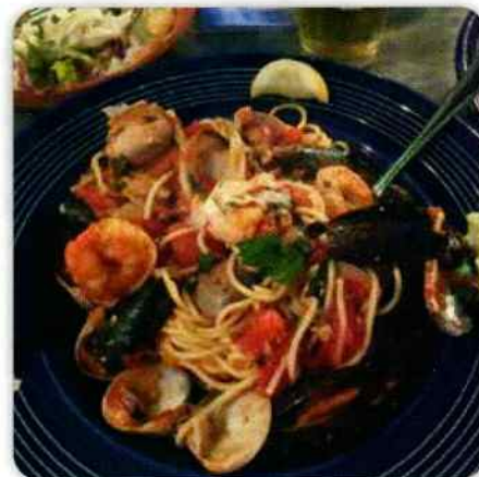
Frutti Di Mare

Italian seasoned chicken sautéed with diced tomatoes & mushrooms. Served in a homemade creamy cheese sauce. Served with your choice of pasta. (Cheese tortellini add 1.50)