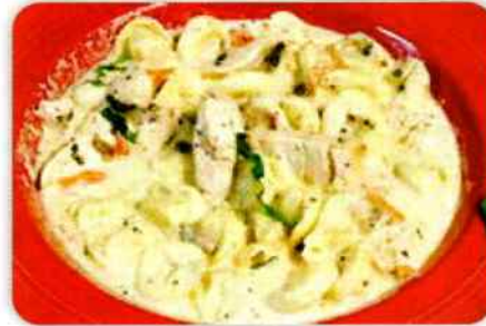
Italian Chicken Pasta with Tortellini

Substitute your sauce for 2.50 more! Choices: Garlic Plum • Alfredo • Ala Vodka