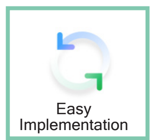
ZERO cost integration for both our testing App and our send-out lab.