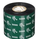
Zebra 5095 Resin Ribbon

Call us on 0161818 6446 for solution demo, trial or label samples