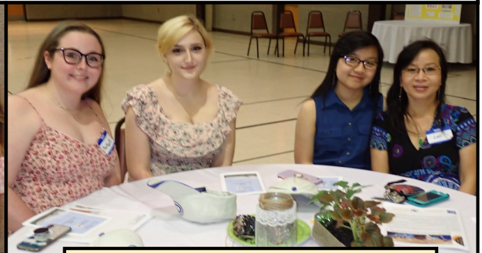
Some of the students on the 2019 Envirothon Team from Orangeburg Preparatory School. The competition was held virtually in 2020.