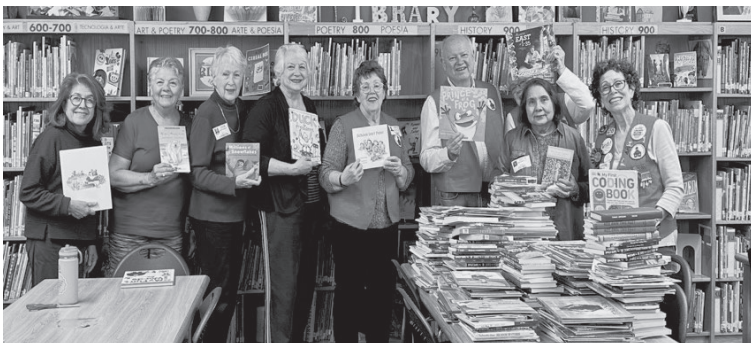
ARTA members helping with the Children's Book Project.

*Note: No collections will take place during the March Birthday Luncheon.