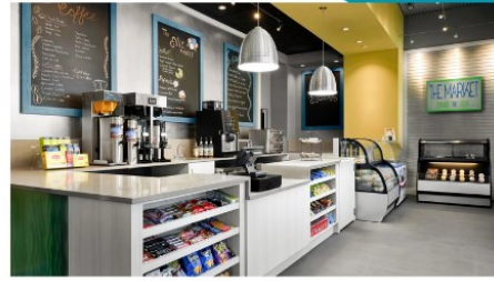
The Market (on site) coffee, beverages, ice cream and individual pizza