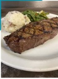
Angelo's Steak & Pasta