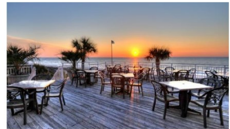
Damon's Grill -walking distance

Myrtle Beach has a variety of fun activities, here are a few: