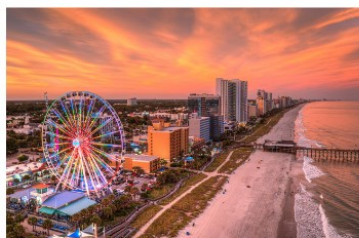
SKY WHEEL BUY 1 GET 1 FREE AGE 60+ GROUP RATES FOR 10 OR MORE