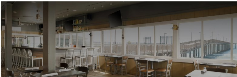
Southern Tide Bar & Grill - Springmaid Pier (on site)