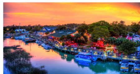
MURRELL'S INLET LOTS OF RESTAURANTS AND A BEAUTIFUL BOARDWALK