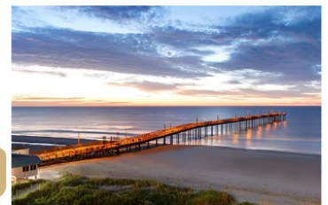
TAKE A WALK ON THE PIER, IT'S FREE FOR GUESTS!

FISH ON SPRINGMAID PIER: 2 FREE FISHING POLES PER ROOM; BAIT IS THE ONLY COST