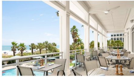
Ocean Blue Restaurant (on site)