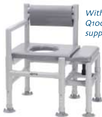
With optional Q100L leg support

Inside edge of commode core is internally rounded and then wrapped for maximum pressure distribution and relief. Closed cell water repellent foam is completely encapsulated in a five dip process of flexible vinyl.