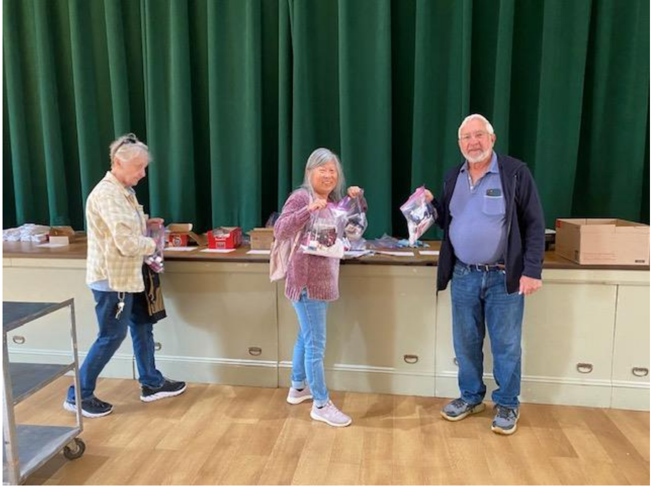
Making Holiday care packets for IPP To be given to the women at Bedford Hills & Taconic Correctional Centers