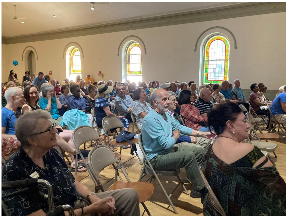
Enjoying the music