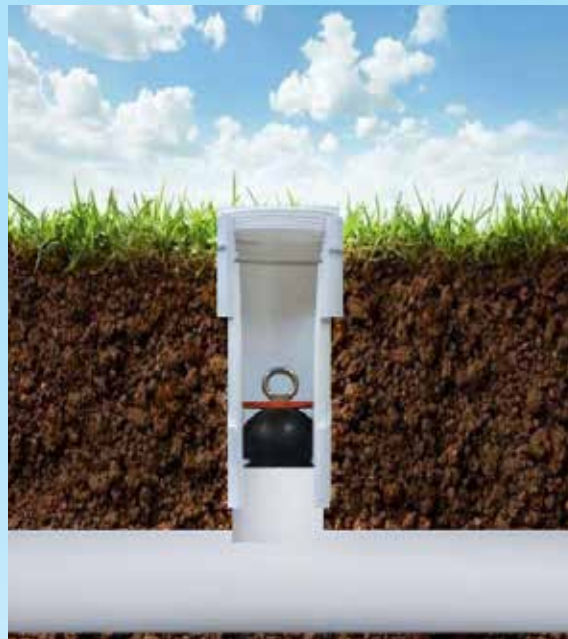
Plug shown without Locator (Standard Plug)

USSSI can install the LDL™ Clean-out Plug & Smart Plug assembly as part of our complete AIIM Inflow and Infiltration Abatement program.