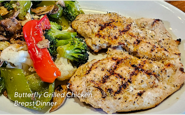
Butterfly Grilled Chicken Breast Dinner