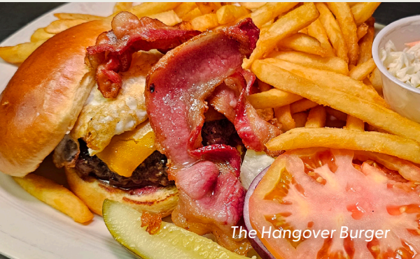
The Hangover Burger