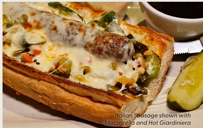
Italian Sausage shown with Mozzarella and Hot Giardiniera

Char-broiled chicken, served on a brioche bun with lettuce, tomato, onion and a pickle