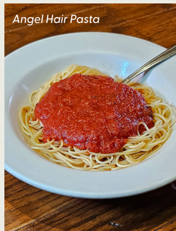
Angel Hair Pasta