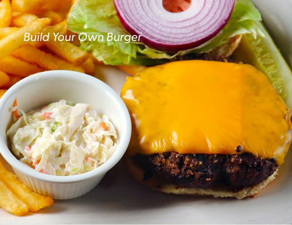
Build Your Own Burger