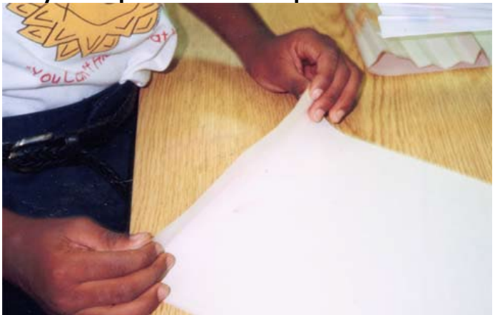
Press each fold as you go.