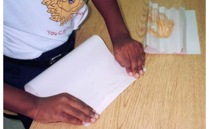
Fold. Press. Flip. Fold. Press.