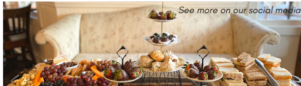
See more on our social media.