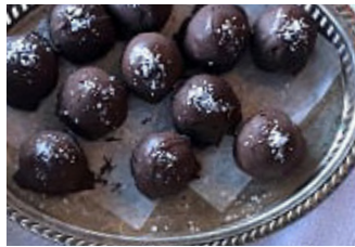
Chocolate Cake Truffles