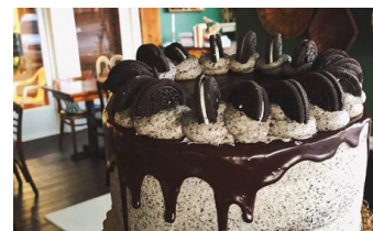
9" Cookies n' Cream