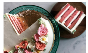
9" Strawberry, custom piping