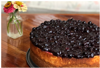
9" Vanilla Bean w/ blueberry