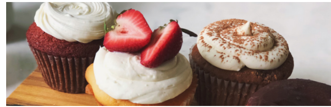
Variety cupcakes: Tiramisu, Berry Delightful, Red Velvet

Ask your server, check out social media, or sign up for our email newsletter