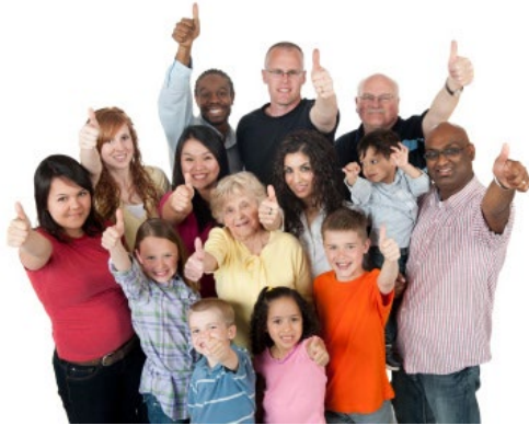
Copyright © State of New Jersey, 2023