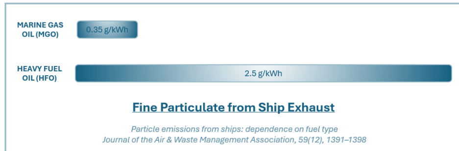
Comparison of Heavy Fuel Oil (HFO) to cleaner Marine Gas Oil (MGO)