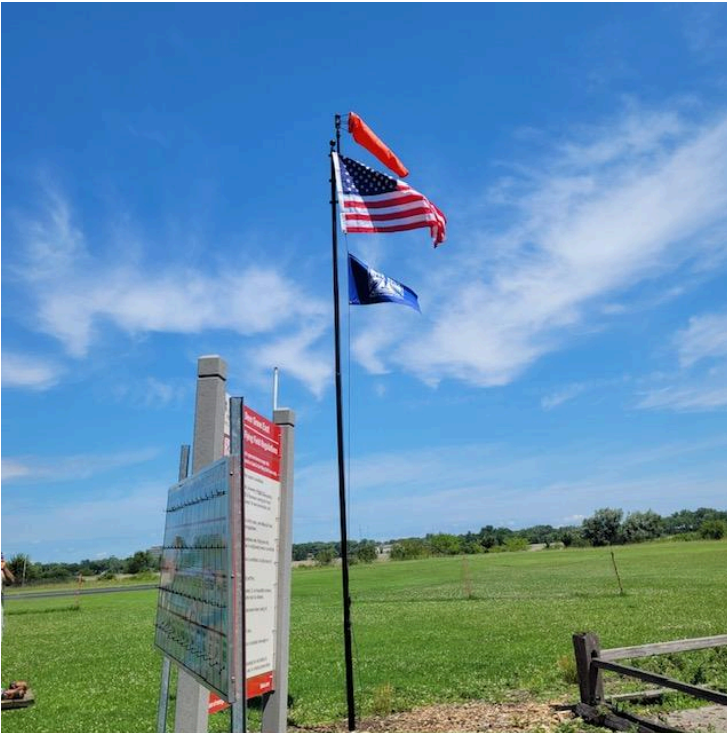
New Flag pole looks great!

For more info or directions call 847-382-3433