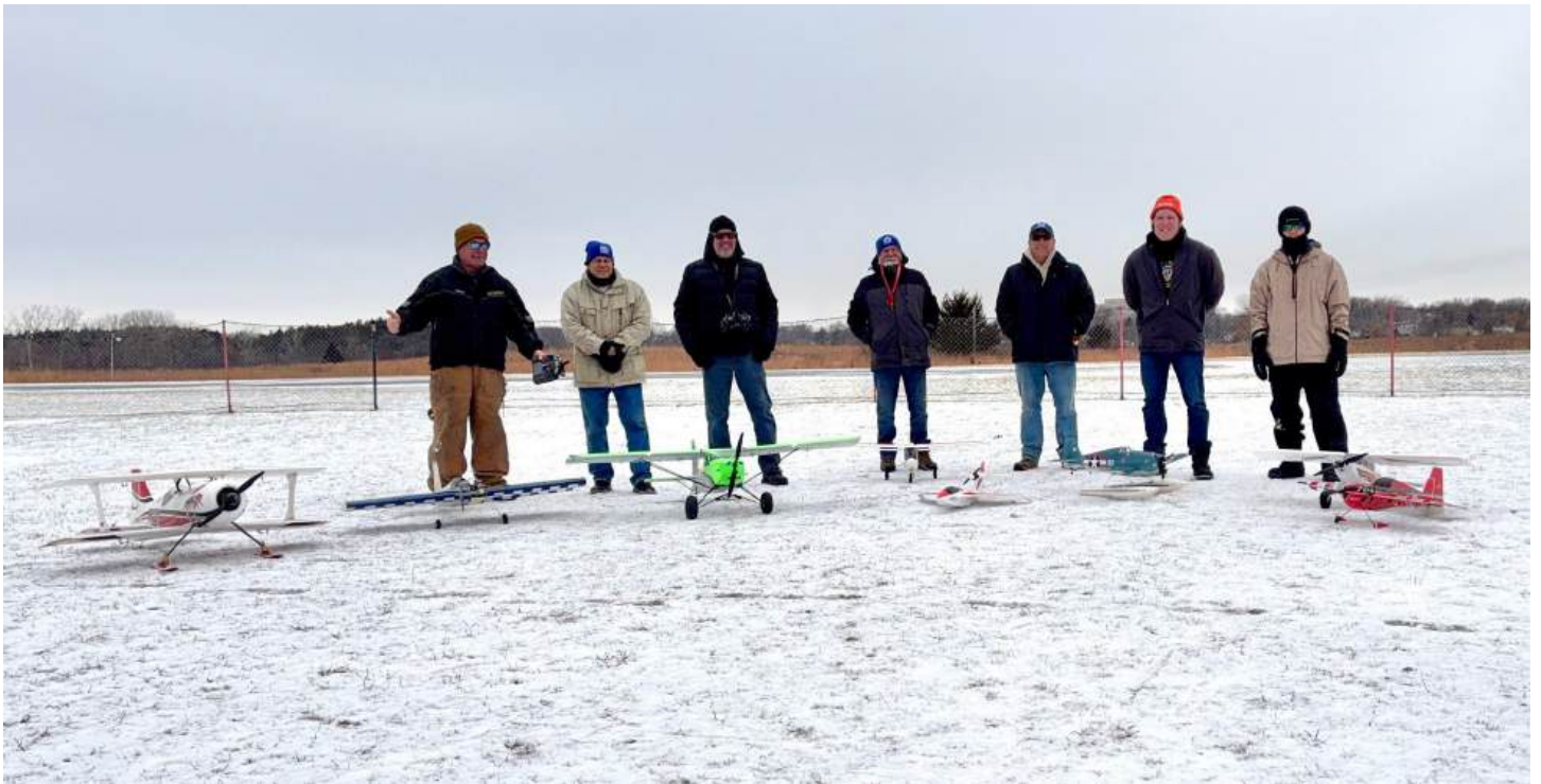
New Year's Day Crew...