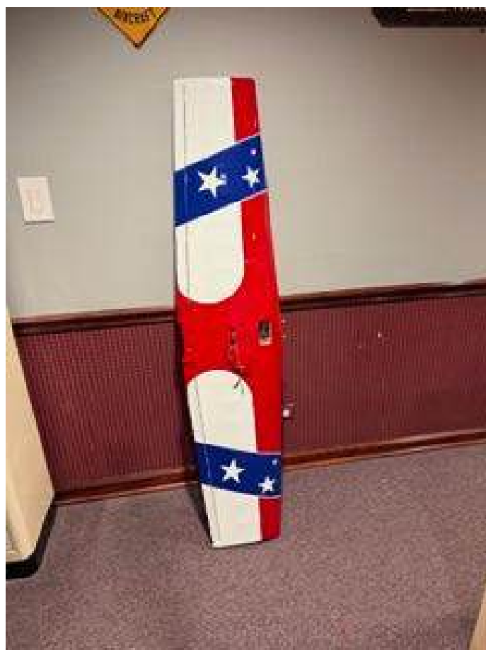
Bruce V's Ultra Sport 60 .... Great color scheme.