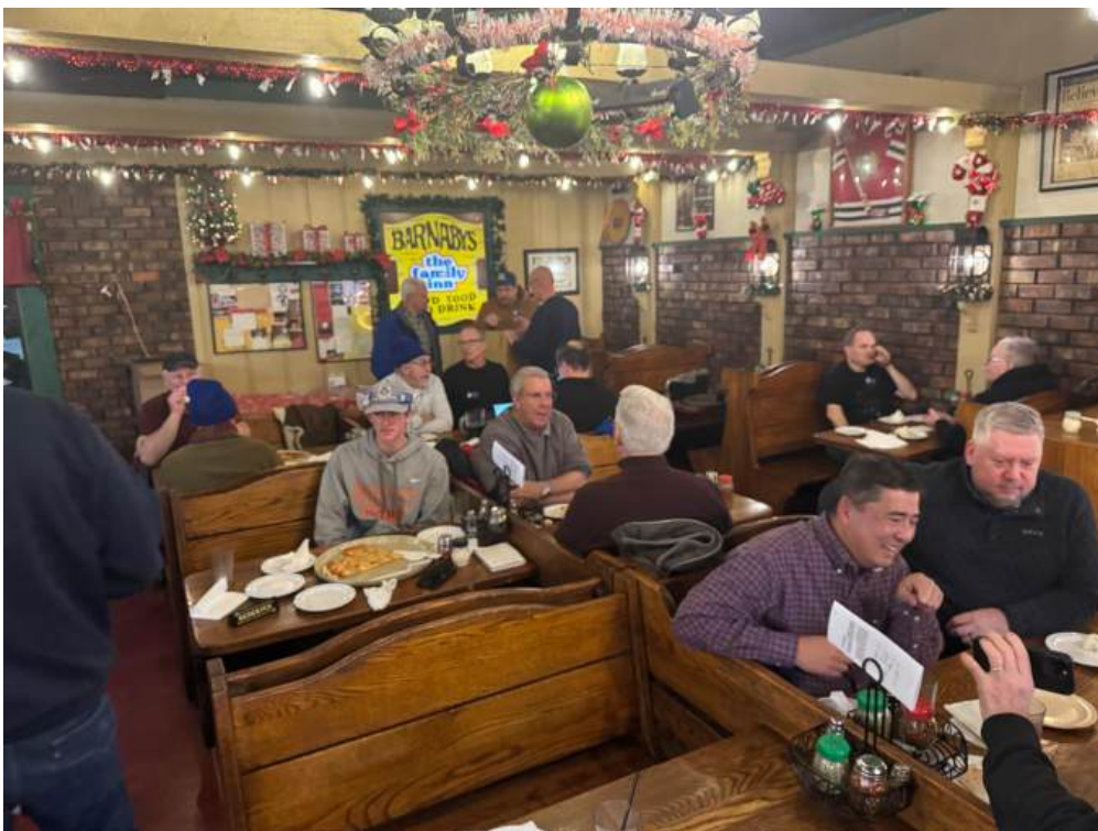
Holiday Party at Barnaby's Great turnout!