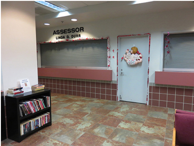
Annex lobby near County Recorder's office.

Best of all? No need to return the book, it is yours to keep – courtesy of the Greenlee County Library system.