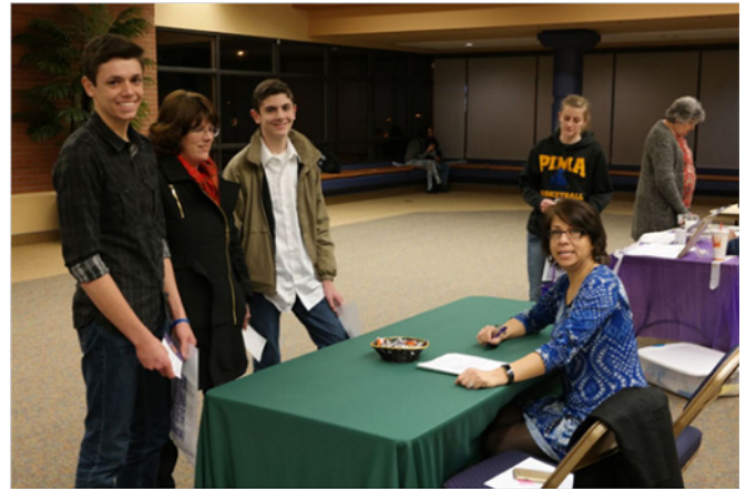
High school students from the area took advantage of the Cash for College event held recently by the Arizona Community Foundation of the Gila Valley.

Many of the scholarship opportunities presented at Cash for College have their application deadlines