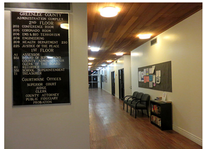
Annex across from Justice of the Peace Court.