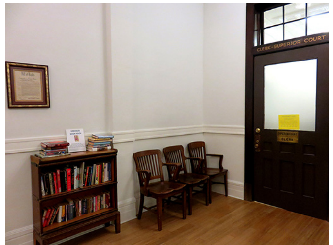
Old Courthouse by Court Clerk's office.