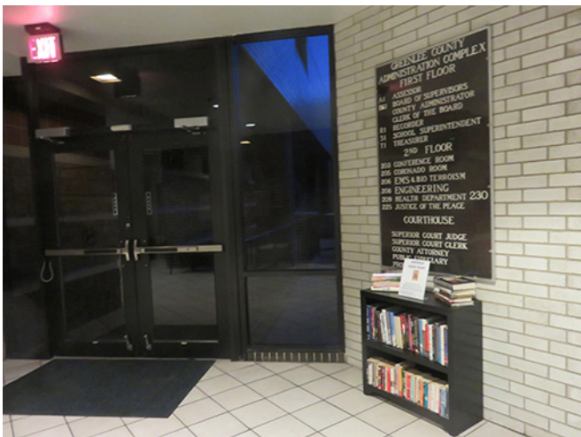
Annex lobby near street entrance from Fifth Street.