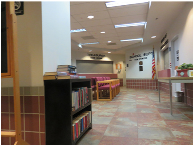
Annex waiting area near Board of Supervisors' office.