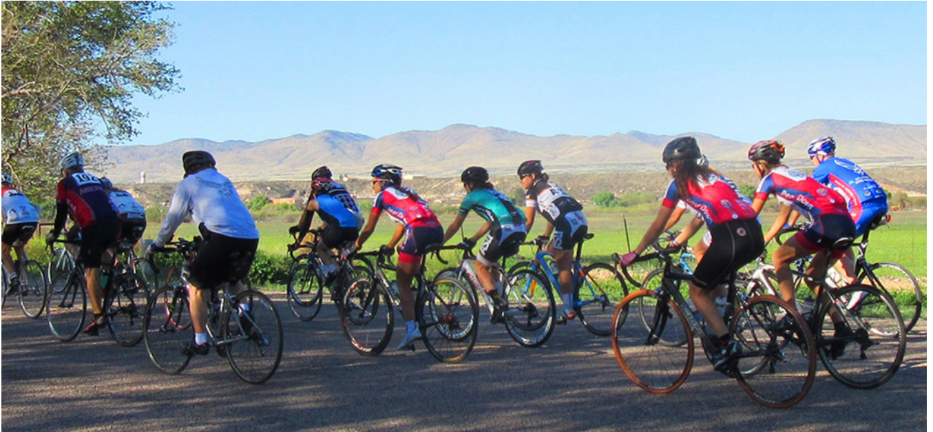
Action in the Javelina Chase in 2015.