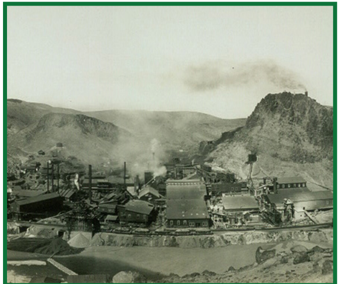
Clifton, c. 1909, from the Library of Congress.

This project fits so well with the economic development and tourism plans for the county. Hopefully this website can help promote our area by letting visitors know more about the county and get them interested in visiting us.”