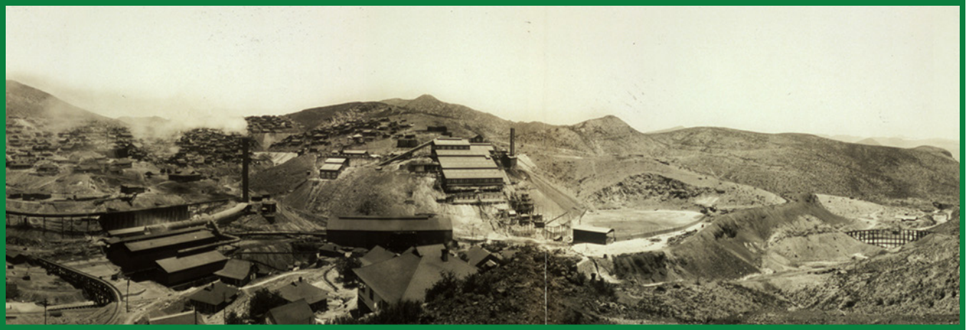
Morenci, c. 1909, from the Library of Congress collection.