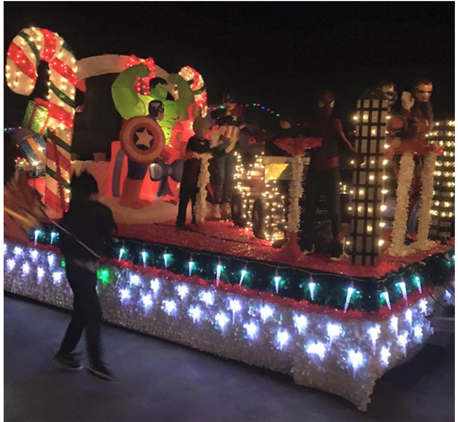
The Town of Clifton's float, above, won the prize for Best Use of Theme, "My Super Hero Christmas." Morenci Pride Band won in the Best Music category.

After the sun set, Chase Creek Street was lit up by the Festival of Lights parade complete with entries from businesses, organizations and families.