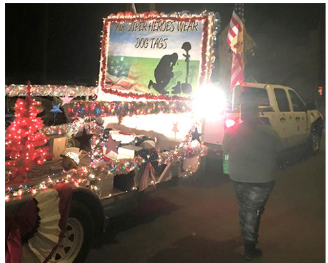
This float, by Michelle's Bar & Grill, was Best of Parade and Facebook Favorite.