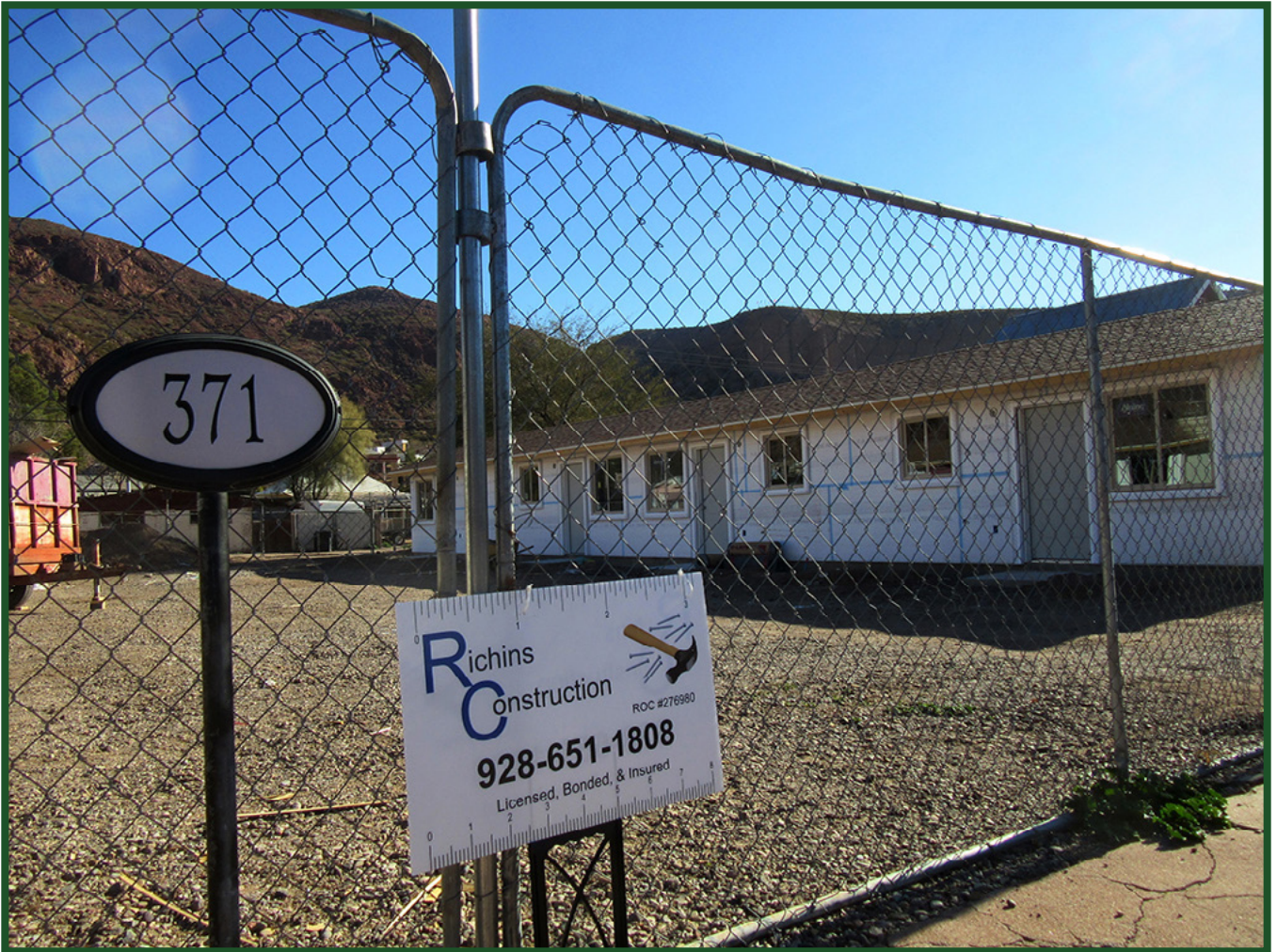
No 'Hill Street Blues' in Clifton. In fact quite the contrary is true both on Hill Street and on famous Coronado Boulevard in Clifton. The 12 new Empire apartments are nearing completion. Photos were taken on Jan. 3.