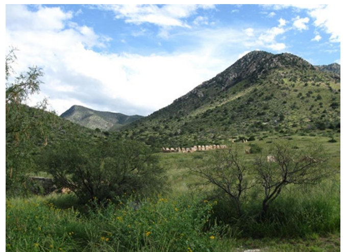
Fort Bowie is one of the many national parks, monuments and historic sites in Arizona.