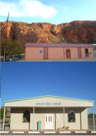
Above: Clifton Public Library open Mon 10-6 Tues-Thursday 10-5 and Fri 10-4