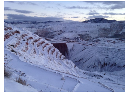
Photo of snow in Morenci Mine