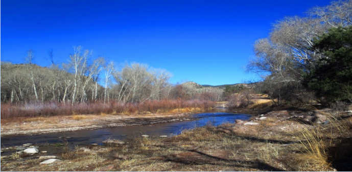
WHY THEY CALL IT : BLUE RIVER