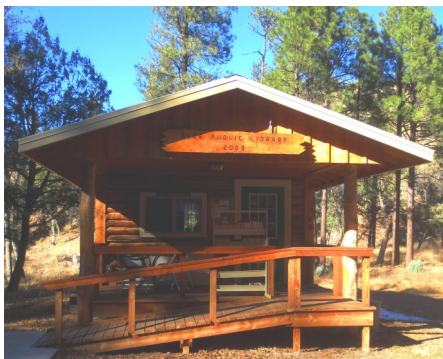
Above: Blue Community Public Library open Tues and Saturday 10-2

The Greenlee County Library webpage ( http://www.greenleelibraries.org/ ) has a lot of information for the public to use. The site offers links to post-secondary school information that are campus oriented or on-line programs. If you as a student or parent need some information, please visit that part of our site. Greenlee County Library System also has free database searches available to the public. To get to the databases provided by the AZ State Library, go to the County Library Website and click on the Statewide Database link on the left.