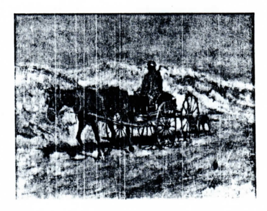
Suffolk County Archaeological Association Nassau County Archaeological Committee