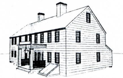
TERRY/KETCHAM INN CENTER MORICHES, LONG ISLAND, NEW YORK On the National Register of Historic Places

The Society for Women Archaeologists has been formed. For information contact them at P.O. Box 4624, Rockville, MD 20849.