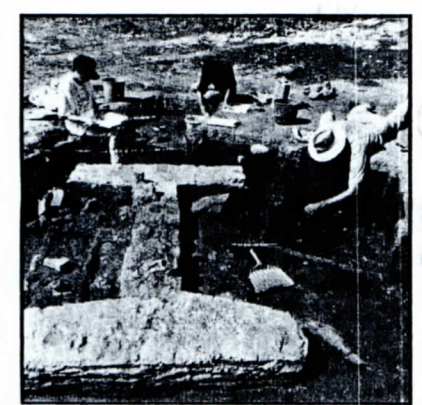
Barracks' fireplace excavated in 1994 and 1995