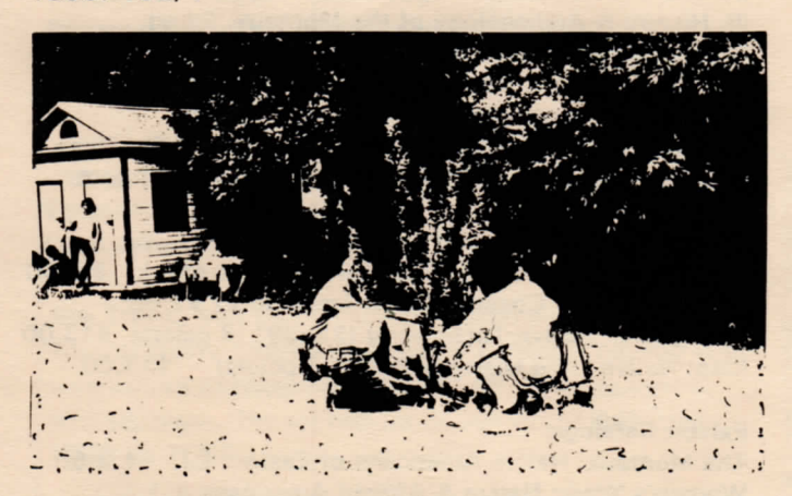
The Southwest Corner of the Bath House.

hammerstone; and a grit tempered sherd. This sherd had a crudely scraped interior and an exterior decorated with four parallel incised lines, and a fifth bordering them at an angle. These incised lines overlay cord-wrapped paddle stamping. In most respects it resembles Bowmans Brook Incised vessel, which would place it chronologically in the early component of the Clasons Point Focus (see Smith, C 1950: 192).