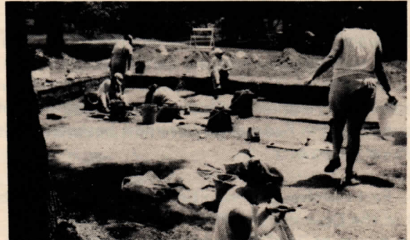
The Sylvester Manor 1999 excavation, looking south from the Manor house.