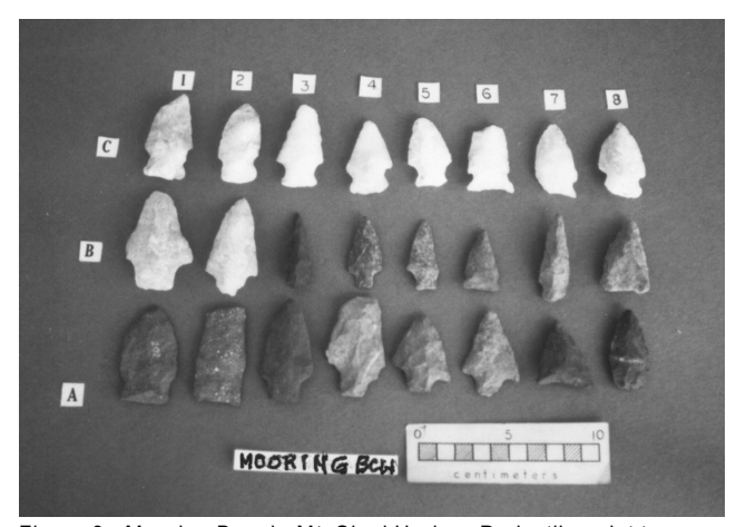
Figure 3. Mooring Beach, Mt. Sinai Harbor. Projectile point types.

In 1972, while working at the nearby Tiger Lily Site, I made a test excavation under a thick shell layer exposed by Rudge just off the dirt road that ran between Winston Drive and Crystal Brook Hollow Road. At a depth of sixteen inches (40.64cm) below the surface, two classic, quartz Orient fishtail projectile points came to light along with a broken drill tip. This evidence shows that a Transitional Period underlays a thick layer of oyster and hard clam shells. I concur with Gwynne's conclusions that the site was a Late Archaic base camp for year round occupation. The lack of adequate provenience for most of the artifacts, along with sparse notes and records, make it difficult to reconstruct any solid time lines of cultural occupancy