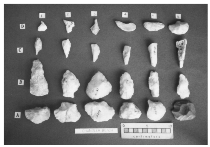
Figure 2. Chandler beach, Mt. Sinai Harbor. D 1-3 gravers; D 4 spokeshaves; D 5-6 scrapers; C drills; B knives; A scrapers.

A total of 103 projectile points were collected at the beach, (see Table 1) fourteen of which fell into the untyped category. The ten Orient Fishtail points represent the Transitional Period. Some 40 limonite pieces were tallied from the beach area - most showing signs of being worked to produce the red pigments that are associated with the Orient Transitional Period.