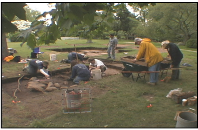
Excavation at Sylvester Manor

The film is available on DVD for $40., plus $6.00 sales tax and shipping, from S.C.A.A. A version for teachers with a menu to locate the strands of world history, slavery, sugar production, religious tolerance, etc. for classroom use, is also available at the same price.