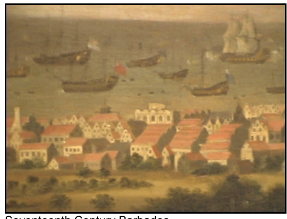
Seventeenth Century Barbados

The information in this film supports Editor at Large of the Long Island History Journal Wolf Schaefer's view that "an integrated study of local, national, and global history is not only possible but preferable."