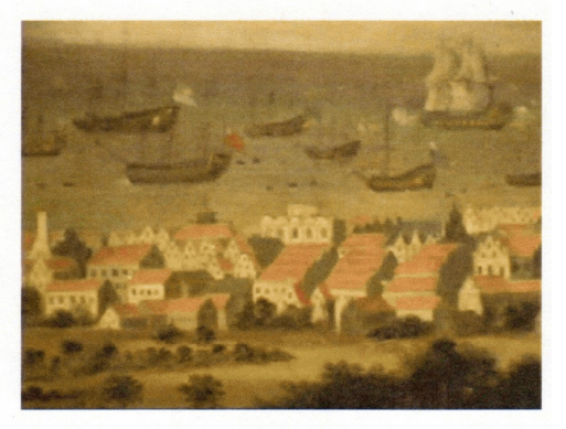
17th Century Barbados

Classroom version menu is divided into topical segments – Dutch - World History, Slavery, Sugar Production, high tech archaeology, religious toleration and more