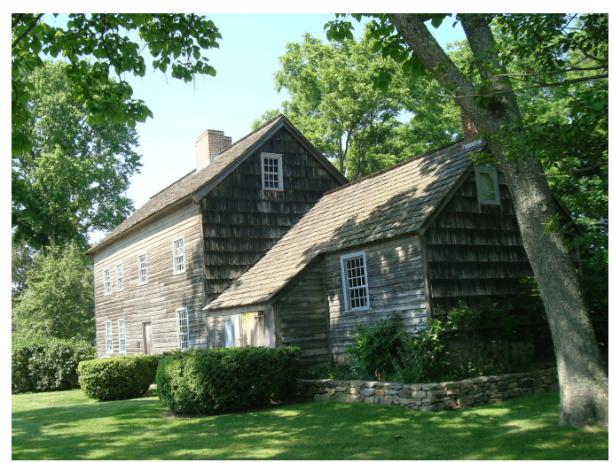
Figure 1 - Thompson House

The Thompson House project is an ongoing historical and archaeological investigation of an eighteenth- and nineteenth-century farmstead in Setauket, New York (Figure 1). The house was a plural site, where diverse people interacted and shared objects, practices, and space as they lived and negotiated a daily existence. Historical research revealed the home's plural origins while archaeological excavations recovered materials related to daily activity. Two objectives directed the design and implementation of this research. First, to determine how the transition from enslaved to wage labor unfolded in practice and affected the relations between white families and nonwhite laborers. Because people of African and American and mixed-heritage ancestry have faded from public memory, the second objective of this project is to bring to light the contributions of nonwhite residents and laborers to the making of the Thompson House site. Grants from the National Science and Wenner Gren Foundations funded this research project.