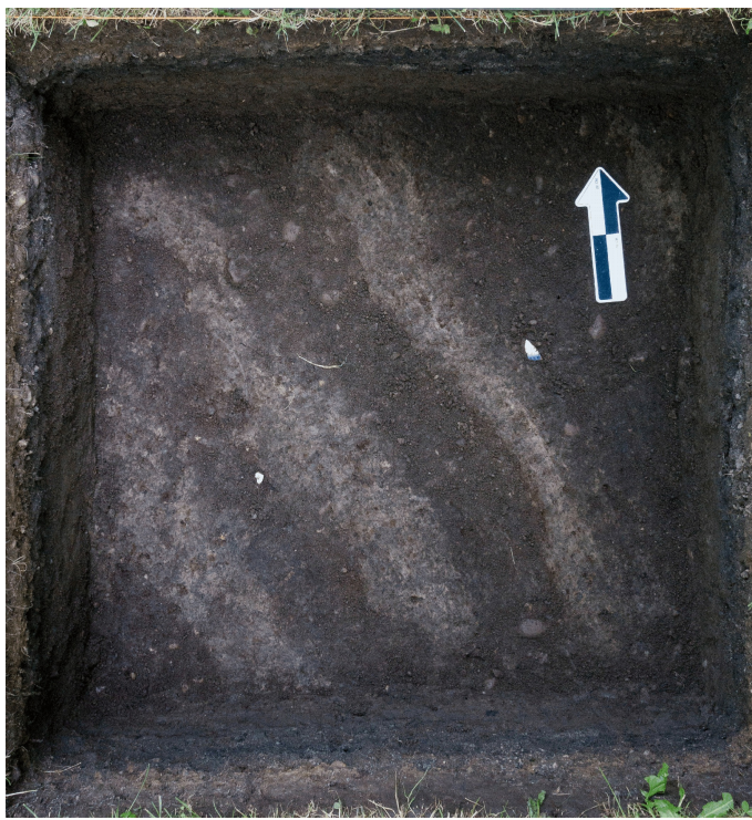
Figure 3. Plan drawing of first floor of Thompson House showing ca. 1800 additions. (P) parlor; (H) hall; (SW) service wing; (K) kitchen addition; (W) wing addition. Not to scale. (Drawing by author, 2014)

Archaeological data suggests additional activities were relocated to other areas of the property around the same time the kitchen and wing were built in the early 1800s. One such activity is fertilizer production, represented archaeologically by a series of shell dumps dating to the 1700s. Shell fertilizer production is a practice well documented on Long Island historically (Livingston 1794; Pell 1846) and archaeologically (Ceci 1984; Lightfoot et al. 1985). Farmers and workers mined Native American shell mounds along the Long Island coast and "pulverized" the shell before spreading it with manure as a composite fertilizer for their crops. Gardening is another activity represented by a pre-emancipation feature consisting of a series of alternating deposits of very dark brown loam found within the surrounding lighter colored matrix. These are interpreted as the rows of a kitchen garden for provisioning the Thompson family (Figure 4. The narrow, irregular deposits, the feature's close proximity to the house, and references to a house garden in family papers support this conclusion. Evidence for fertilizer production and gardening were absent in nineteenth-century contexts. Discussion/Implications