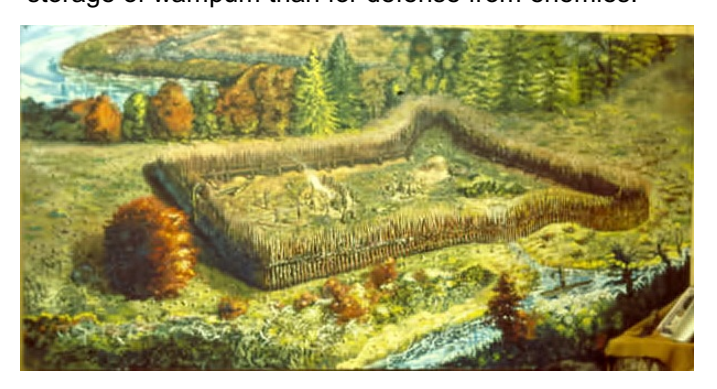
Fort Corchaug, Cutchogue

The arrival of the Dutch and English explorers marked a different lifestyle for the Native people and the Europeans -- again marked by trade networks. The Europeans, barring finding gold or other metals as sought by alchemist John Winthrop, Jr, (see SCAA film, Fishers Island Manor), sought furs to warm themselves in their cold stone structures at home. The Native people sought what their Stone Age culture did not have metals, as well as textile clothing, novel and presumably more comfortable than their skin clothing. These mutual needs promoted the building of Native 'forts' by the Native people with supervision by the Dutch. The forts were built of tree trunk palisades in the Native tradition but had the four and five sided shape of forts throughout the European world. They appear to have been used more as workplaces for the production and storage of wampum than for defense from enemies.