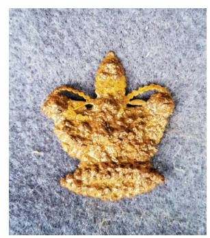
Metallic crown motif artifact found by metal detecting at Setauket, Possibly a Loyalist accouterment

conflicts. Ground Penetrating Radar surveys completed at the sites give deep underground mapping of the features. This aids in delineating underground structures such as fortification works and buildings formerly on the battlefields. The field work is planned to be followed up by laboratory analysis and future public presentations in the Long Island region. Resulting interpretation is also planned to be documented in a report available to the public on the LAMAR