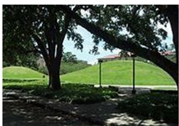
LSU Campus Mound

According to Geoffrey Clayton - LSU, Astronomer and Study co-author, the mounds are aligned along an azimuth that is about 8.5 degrees east of true north, which aligns with Arcturus (red giant state) 6,000 years ago or so. Arcturus would rise 8.5 degrees east of north thereby aligning it with the tops of both mounds.