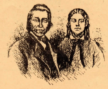
KING AND QUEEN OF THE MONTAUKS.

LONG ISLAND BOOKS, MAPS, AND PRINTS, Catalog No. 2, from Yorkshire, P.O. Box 381, Miller Place, N.Y. 11764.