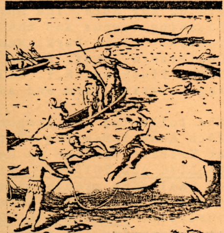
SUFFOLK COUNTY ARCHAEOLOGICAL ASSOCIATION

The SCAA newsletter format has been changed! As of Volume 9, No. 3, the newsletter will include brief statements from local archaeologists and interested lay people on matters pertinent to the science of archaeology. In this issue, The Paul Site of Old Brookville, Nassau County, is featured. All interested parties wishing to submit a consideration should include no more than three single spaced pages with 1" margins. Artwork is limited to illustrations but exceptional photographs will be considered. See the back of this issue for the forwarding address of the editor.