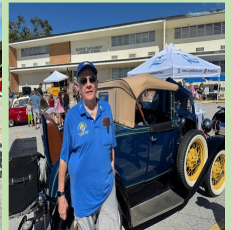
IMAGES OF OUR SUCCESSFUL ANNUAL CAR SHOW _ THANKS TO ALL KNIGHTS & VOLUNTEERS