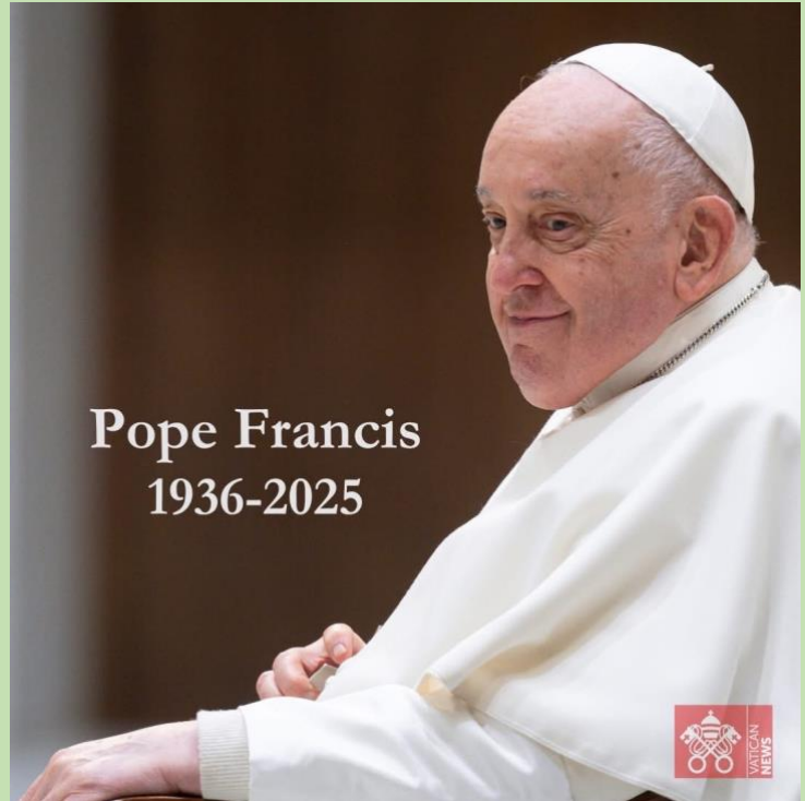
CARDINAL FATHER JORGE MARIO BERGOLIA (December 17, 1936 – April 21, 2025)