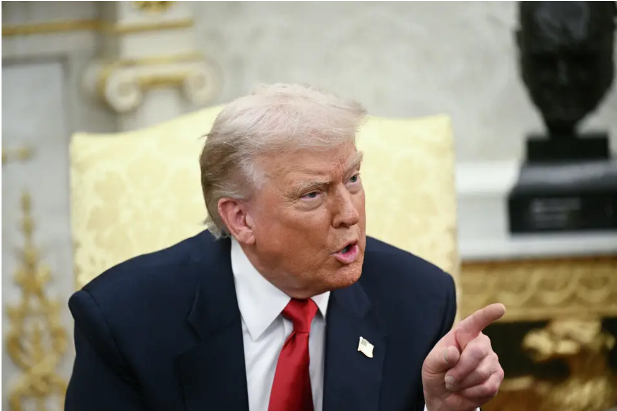
President Donald Trump speaks to reporters on Tuesday in the Oval Office. In a social media post on Thursday, Trump said that Democrats who called on the military to disobey “illegal” orders should be