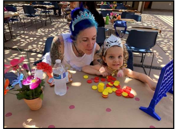
Moms and kids were all smiles as they enjoyed games, crafts, and refreshments at the Tea.

Asian American & Pacific Islander Heritage Month was celebrated on Saturday, May 20th, in the Library Courtyard. More than 150 guests enjoyed this popular program.