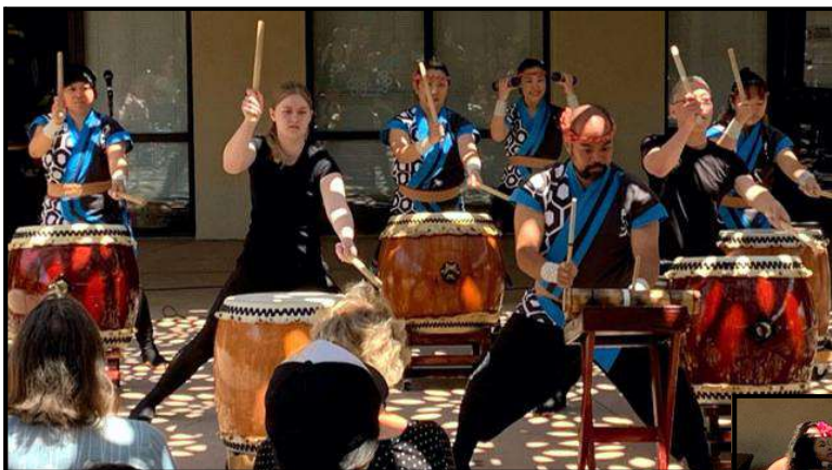
Japanese drummers "Genbu Daiko," is a contemporary percussion ensemble specializing in taiko, the art of Japanese drums.

Asian American & Pacific Islander Heritage Month was celebrated on Saturday, May 20th, in the Library Courtyard. More than 150 guests enjoyed this popular program.