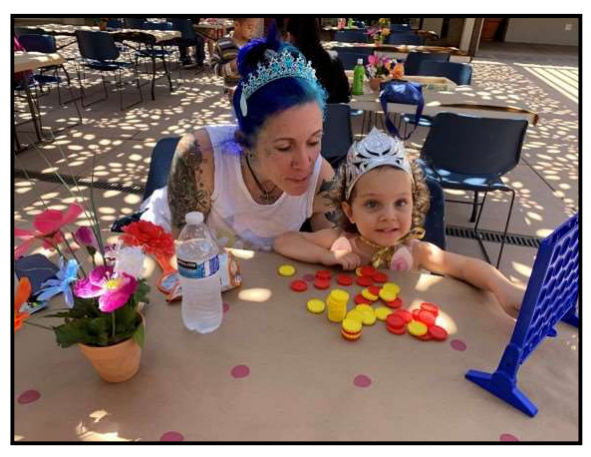
Moms and kids were all smiles as they enjoyed games, crafts, and refreshments at the Tea.

Asian American & Pacific Islander Heritage Month was celebrated on Saturday, May 20th, in the Library Courtyard. More than 150 guests enjoyed this popular program.